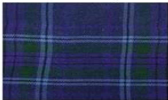
Spirit of Scotland