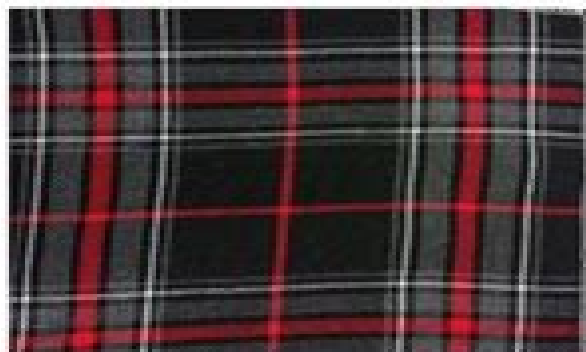
Spirit of the Highlander