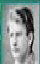
Philo Farnsworth American inventor who is credited with the invention of the electronic television