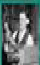
Vladimir Zworykin Russian-American inventor who developed the iconoscope, an early image pickup tube