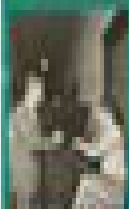
Paul Nipkow German inventor who contributed to the development of television

Image source: (first picture) by unknown (the television set)