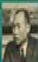
John Logie Baird Scottish inventor who demonstrated the first television system