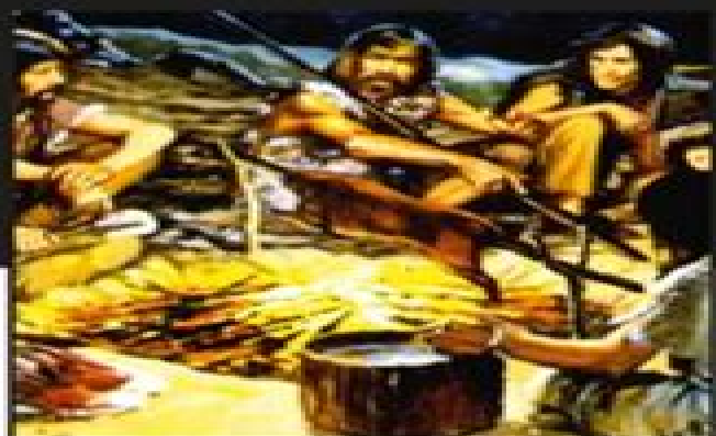
Sid's cave pals try to convince him that fire has its uses.