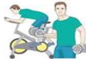
Consistent Exercise Weights + Cardio