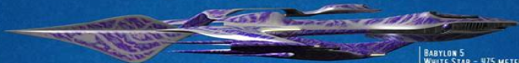
babylon 5 white star - 475 METERS