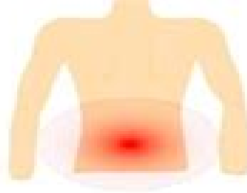
Reduce Back Pain