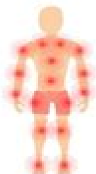
Improves Blood Circulation