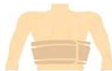
Post Surgery Pain