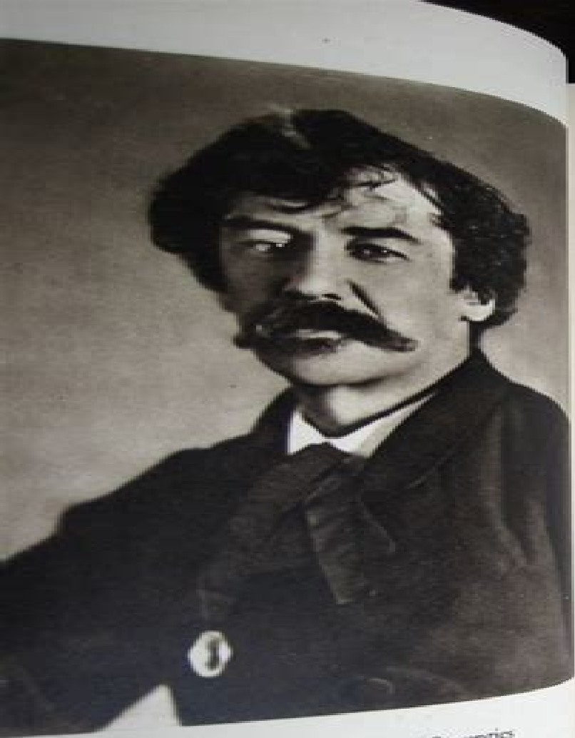
Whistler in the Seventies