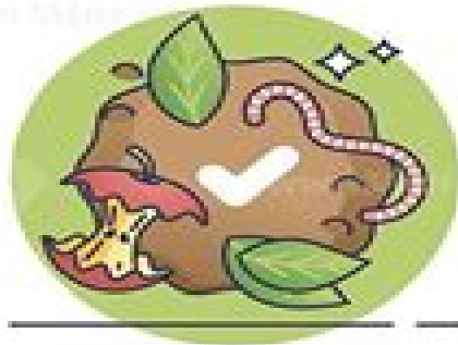
ADDING ORGANIC MATTER