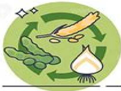
PRACTICING CROP ROTATION