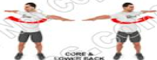
CORE & LOWER BACK