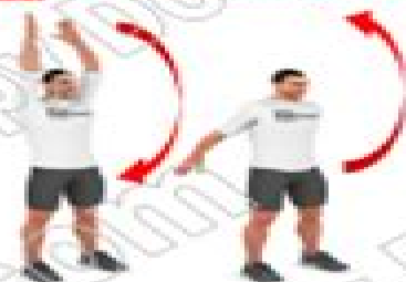
SHOULDERS & UPPER BACK

⚠️ Consult a physician before starting any stretching regime. This chart is for informational purposes only.