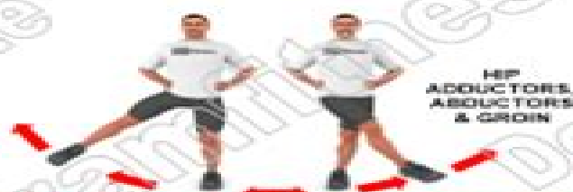
HIP ADDUCTORS, ABDUCTORS & GROIN