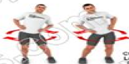
CORE & LOWER BACK